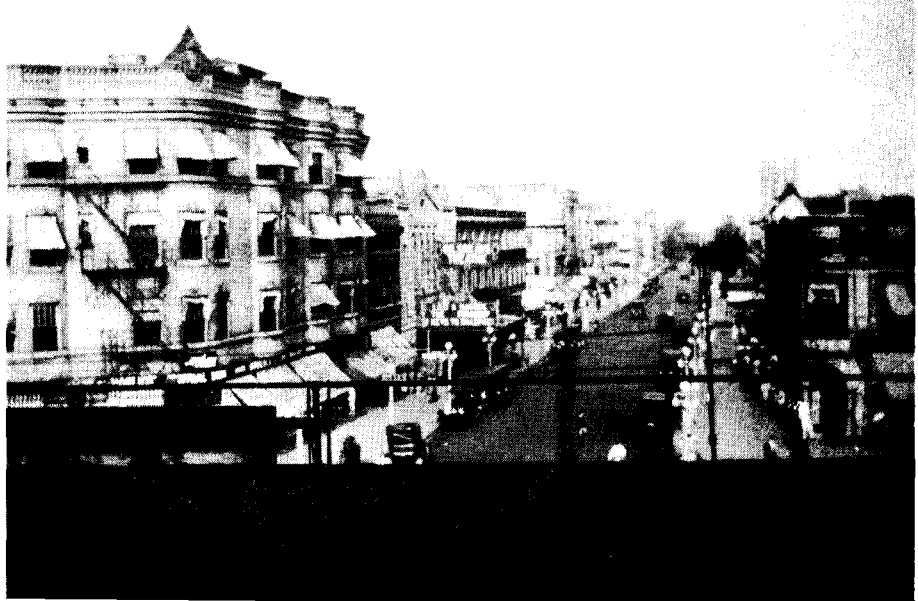
Sheridan Road Elevated platform. The Armstrongs' first home after marriage was 11/2 blocks down this street.